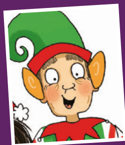
Grandpa Matt (age never you mind!)

Duration: This adventure will take around 45 minutes to one hour , depending on how long you take to solve the history mystery riddles!