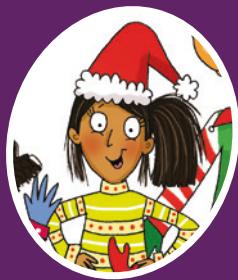
Yasmin (age 11)