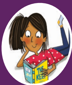
Yasmin (age 11)