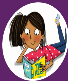
Yasmin (age 11)